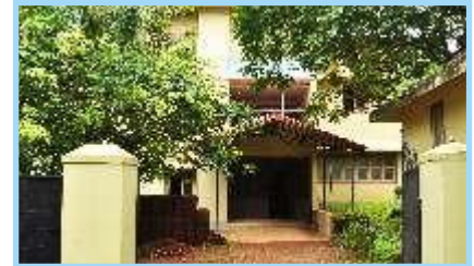
Moulana Azad Girls Hostel