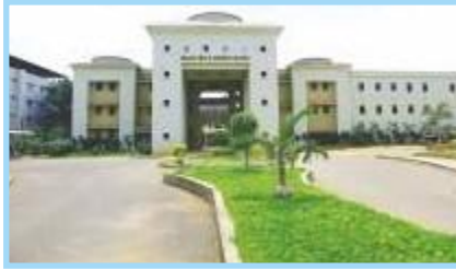
Majlis Arts & Science College