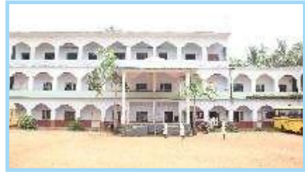
Majlis Higher Secondary School