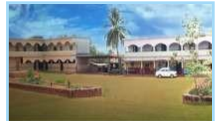
Majlis Pre-Primary & LP School