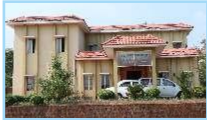
Majlis Administrative Office