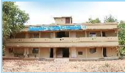
Majlis Ummariya Wafi College